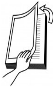
Open your book.